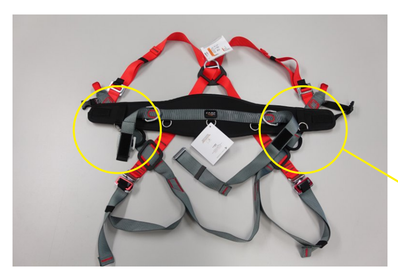
STEP 3 Open the velcros of the belt.