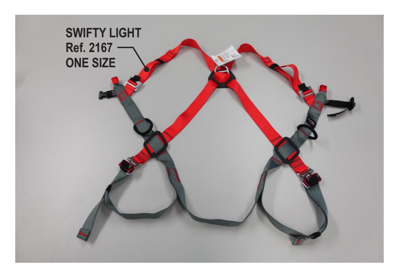
STEP 1 Open the harness*.