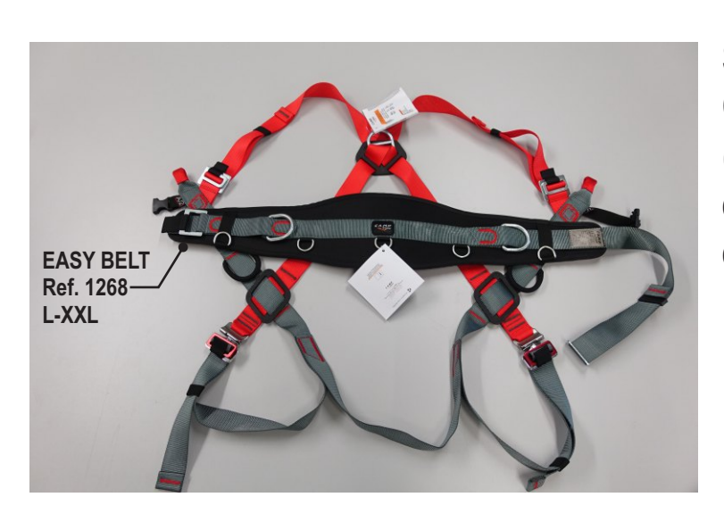
STEP 2 Choose the size of the Easy Belt (S-L or L-XXL); open the belt and place it on the harness*.